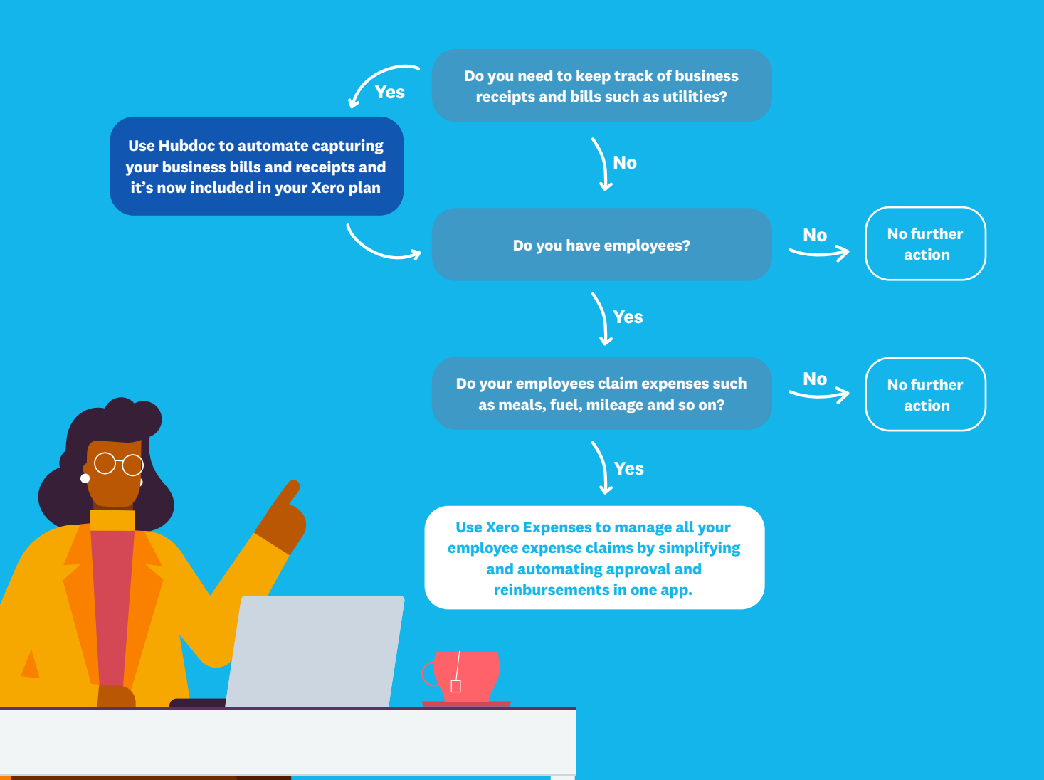
Figure out what you need